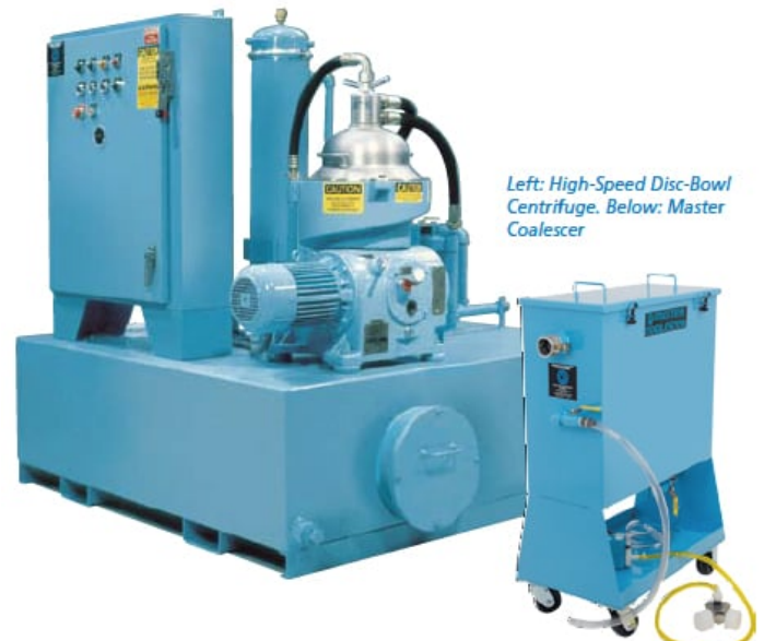
Left: High-Speed Disc-Bowl Centrifuge. Below: Master Coalescer

Coalescers will remove both dispersed and free tramp oil . They are, in effect, special tanks where oleophilic (oil attracting) media or plates coalesce (merge small oil droplets into large oil droplets) the dispersed oil so that it can be skimmed off. These coalescers increase the effective size of the sump and as flow rates are low there is plenty of quiescent time for the oil to "split out" and rise to the surface. Coalescers are very effective when the tramp oils are not readily soluble in the working solution. Even a small amount of detergency in either the fluid or the oil will reduce the effectiveness of a coalescer. The classic use for coalescers is to separate "bilge and ballast" water (often salt water) from residual and spilled oil in the bilges and tanks. The efficiency of coalescers is similar to that of a settling tank with a similar retention time.