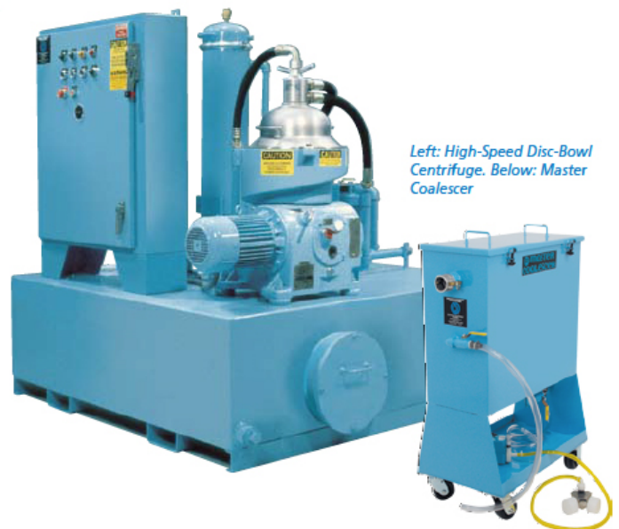
Left: High-Speed Disc-Bowl Centrifuge. Below: Master Coalescer

Coalescers will remove both dispersed and free tramp oil . They are, in effect, special tanks where oleophilic (oil attracting) media or plates coalesce (merge small oil droplets into large oil droplets) the dispersed oil so that it can be skimmed off. These coalescers increase the effective size of the sump and as flow rates are low there is plenty of quiescent time for the oil to "split out" and rise to the surface. Coalescers are very effective when the tramp oils are not readily soluble in the working solution. Even a small amount of detergency in either the fluid or the oil will reduce the effectiveness of a coalescer. The classic use for coalescers is to separate "bilge and ballast" water (often salt water) from residual and spilled oil in the bilges and tanks. The efficiency of coalescers is similar to that of a settling tank with a similar retention time.