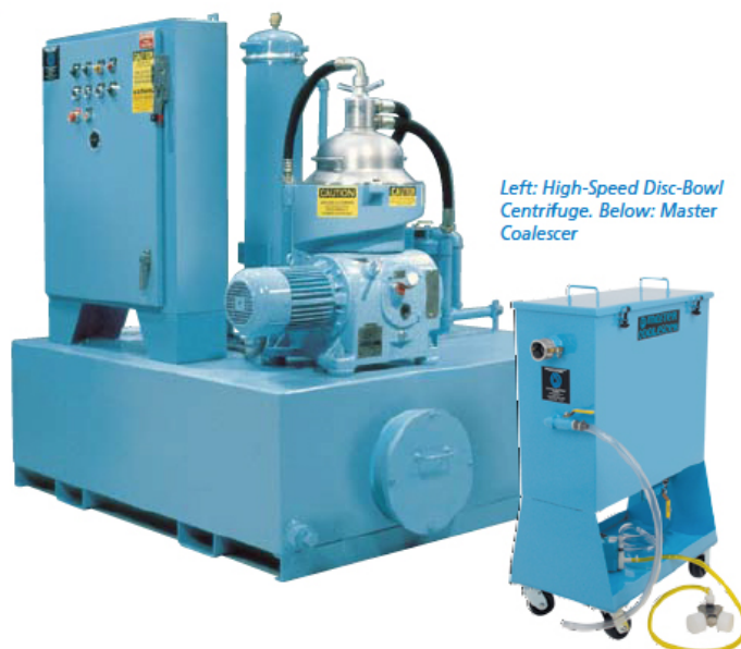
Left: High-Speed Disc-Bowl Centrifuge. Below: Master Coalescer

Coalescers will remove both dispersed and free tramp oil . They are, in effect, special tanks where oleophilic (oil attracting) media or plates coalesce (merge small oil droplets into large oil droplets) the dispersed oil so that it can be skimmed off. These coalescers increase the effective size of the sump and as flow rates are low there is plenty of quiescent time for the oil to "split out" and rise to the surface. Coalescers are very effective when the tramp oils are not readily soluble in the working solution. Even a small amount of detergency in either the fluid or the oil will reduce the effectiveness of a coalescer. The classic use for coalescers is to separate "bilge and ballast" water (often salt water) from residual and spilled oil in the bilges and tanks. The efficiency of coalescers is similar to that of a settling tank with a similar retention time.