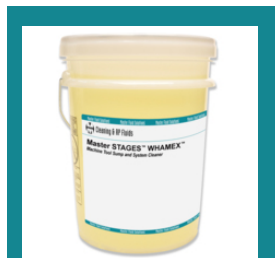
5-gallon pail SKU: WHAMEX-5G UPC-12: 641238027317