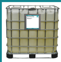
270-gallon tote SKU: WHAMEX-270G UPC-12: 641238033165

Master STAGES™ Whamex™ | ©2004-2026 Master Fluid Solutions® | 2026-02-03