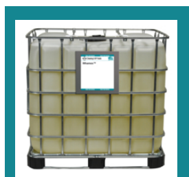
270-gallon tote SKU: WHAMEX-270G UPC-12: 641238033165

Master STAGES™ Whamex™ | ©2004-2026 Master Fluid Solutions® | 2026-03-14