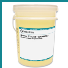
5-gallon pail SKU: WHAMEX-5G UPC-12: 641238027317