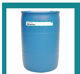
54-gallon drum SKU: WHAMEX-54G UPC-12: 641238027324