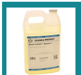
1-gallon jug SKU: WHAMEX-1G UPC-12: 641238027294