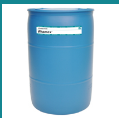
54-gallon drum SKU: WHAMEX-54G UPC-12: 641238027324