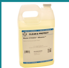
1-gallon jug SKU: WHAMEX-1G UPC-12: 641238027294