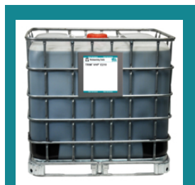
270-gallon tote SKU: VHPE210-270G UPC-12: 641238034285

TRIM ® VHP ® E210 | ©1993-2026 Master Fluid Solutions ® | 2026-05-13