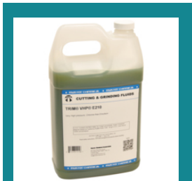
1-gallon jug SKU: VHPE210-1G UPC-12: 641238012016