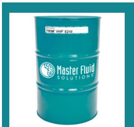
54-gallon drum SKU: VHPE210-54G UPC-12: 641238012054