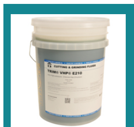
5-gallon pail SKU: VHPE210-5G UPC-12: 641238012047