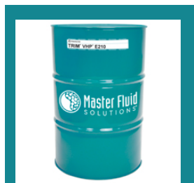
54-gallon drum SKU: VHPE210-54G UPC-12: 641238012054