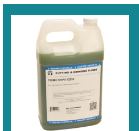
1-gallon jug SKU: VHPE210-1G UPC-12: 641238012016