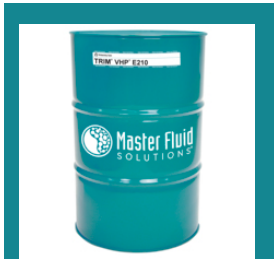
54-gallon drum SKU: VHPE210-54G UPC-12: 641238012054