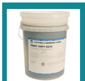
5-gallon pail SKU: VHPE210-5G UPC-12: 641238012047