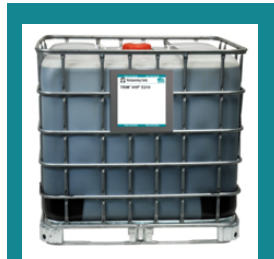
270-gallon tote SKU: VHPE210-270G UPC-12: 641238034285