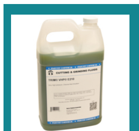
1-gallon jug SKU: VHPE210-1G UPC-12: 641238012016