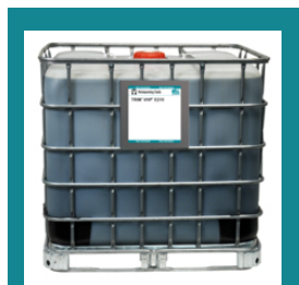
270-gallon tote SKU: VHPE210-270G UPC-12: 641238034285