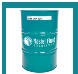
54-gallon drum SKU: VHPE210-54G UPC-12: 641238012054