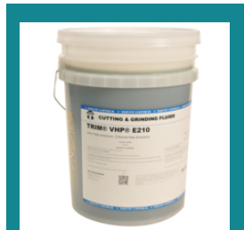
5-gallon pail SKU: VHPE210-5G UPC-12: 641238012047