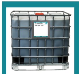
270-gallon tote SKU: VHPE210-270G UPC-12: 641238034285

TRIM ® VHP ® E210 | ©1993-2026 Master Fluid Solutions ® | 2026-06-23