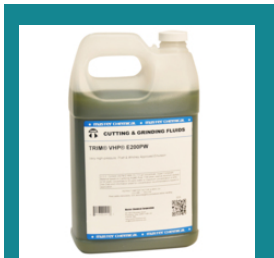
1-gallon jug SKU: VHPE200P-1G UPC-12: 641238024118