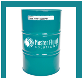
54-gallon drum SKU: VHPE200P-54G UPC-12: 641238011934