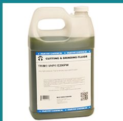
1-gallon jug SKU: VHPE200P-1G UPC-12: 641238024118