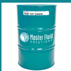
54-gallon drum SKU: VHPE200P-54G UPC-12: 641238011934