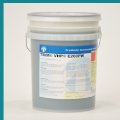
5-gallon pail SKU: VHPE200P-5G UPC-12: 641238011927