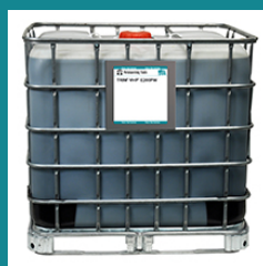
270-gallon tote SKU: VHPE200P-270G UPC-12: 641238036180