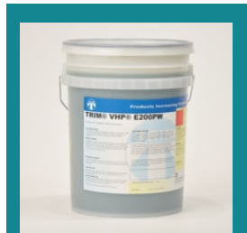
5-gallon pail SKU: VHPE200P-5G UPC-12: 641238011927