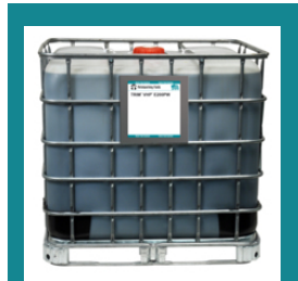
270-gallon tote SKU: VHPE200P-270G UPC-12: 641238036180