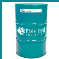
54-gallon drum SKU: TC257-54G UPC-12: 641238083122