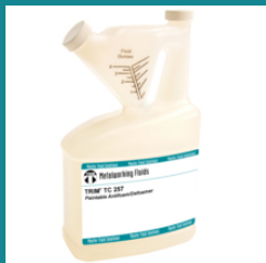
2-quart tip "N" measure ® SKU: TC257-2Q UPC-12: 641238083108