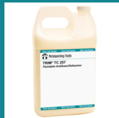
1-gallon jug SKU: TC257-1G UPC-12: 641238083078