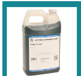
1-gallon jug SKU: TC204-1G UPC-12: 641238021339