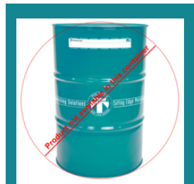
54-gallon drum SKU: TC204-54G UPC-12: