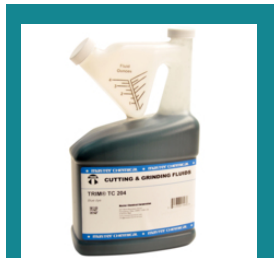
2-quart tip "N" measure ® SKU: TC204-2Q UPC-12: 641238017936