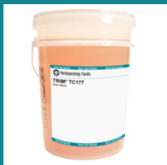
5-gallon pail SKU: TC177-5G UPC-12: 641238010234