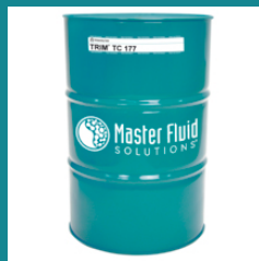
54-gallon drum SKU: TC177-54G UPC-12: 641238010241