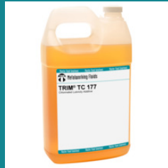
1-gallon jug SKU: TC177-1G UPC-12: 641238074267