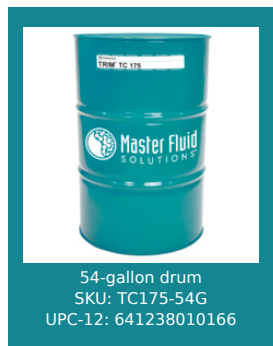
54-gallon drum SKU: TC175-54G UPC-12: 641238010166