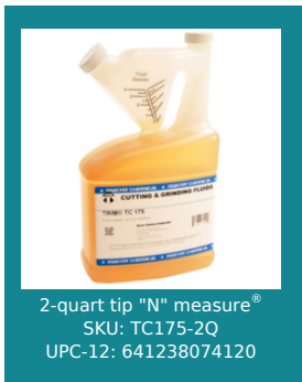
2-quart tip "N" measure ® SKU: TC175-2Q UPC-12: 641238074120