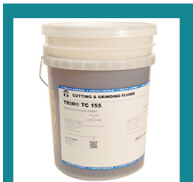
5-gallon pail SKU: TC155-5G UPC-12: 641238009955