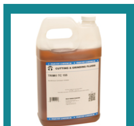
1-gallon jug SKU: TC155-1G UPC-12: 641238009917