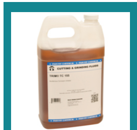
1-gallon jug SKU: TC155-1G UPC-12: 641238009917