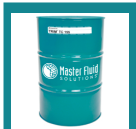
54-gallon drum SKU: TC155-54G UPC-12: 641238009962