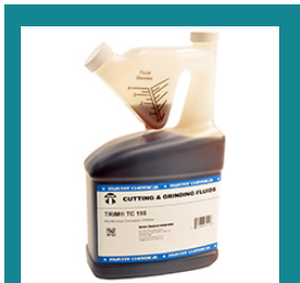
2-quart tip "N" measure ® SKU: TC155-2Q UPC-12: 641238074113