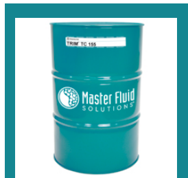
54-gallon drum SKU: TC155-54G UPC-12: 641238009962