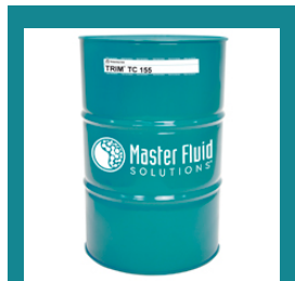
54-gallon drum SKU: TC155-54G UPC-12: 641238009962