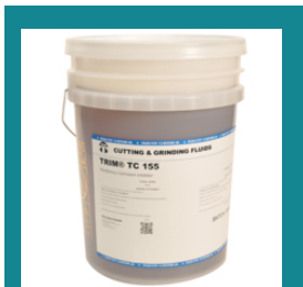
5-gallon pail SKU: TC155-5G UPC-12: 641238009955