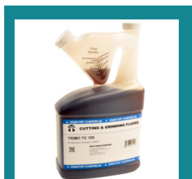
2-quart tip "N" measure ® SKU: TC155-2Q UPC-12: 641238074113