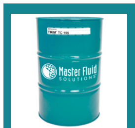
54-gallon drum SKU: TC155-54G UPC-12: 641238009962