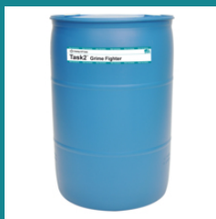
54-gallon drum SKU: TASK2GF-54G UPC-12: 641238031352

Master STAGES™ Task2™ GF | ©2008-2026 Master Fluid Solutions® | 2026-01-31