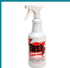
1-quart bottle SKU: TASK2GF-QT UPC-12: 641238030195