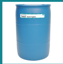
54-gallon drum SKU: TASK2GF-54G UPC-12: 641238031352

Master STAGES™ Task2™ GF | ©2008-2026 Master Fluid Solutions® | 2026-03-14