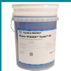
5-gallon pail SKU: TASK2GF-5G UPC-12: 641238031345