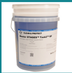
5-gallon pail SKU: TASK2GF-5G UPC-12: 641238031345