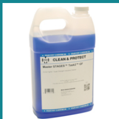
1-gallon jug SKU: TASK2GF-1G UPC-12: 641238031321