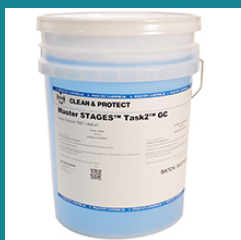
5-gallon pail SKU: TASK2GC-5G UPC-12: 641238000693