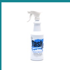
1-quart bottle SKU: TASK2GC-QT UPC-12: 641238047421