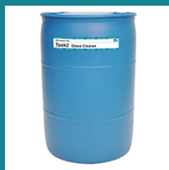
54-gallon drum SKU: TASK2GC-54G UPC-12: 641238047391