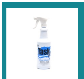
1-quart bottle SKU: TASK2GC-QT UPC-12: 641238047421