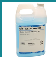
1-gallon jug SKU: TASK2GC-1G UPC-12: 641238000662