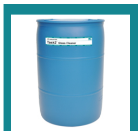
54-gallon drum SKU: TASK2GC-54G UPC-12: 641238047391