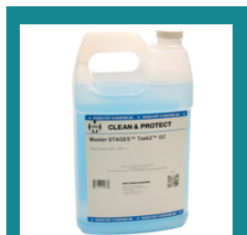
1-gallon jug SKU: TASK2GC-1G UPC-12: 641238000662