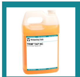
1-gallon jug SKU: TAPNC-1G UPC-12: 641238009337