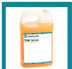
1-gallon jug SKU: TAPNC-1G UPC-12: 641238009337