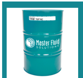
54-gallon drum SKU: TAPNC-54G UPC-12: 641238009399