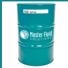
54-gallon drum SKU: TAPNC-54G UPC-12: 641238009399