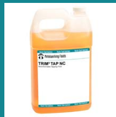
1-gallon jug SKU: TAPNC-1G UPC-12: 641238009337