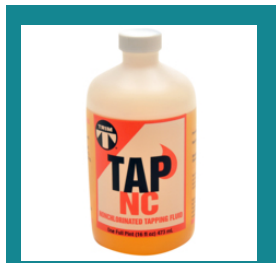
1-pint bottle SKU: TAPNC-1P UPC-12: 641238009429