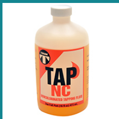
1-pint bottle SKU: TAPNC-1P UPC-12: 641238009429