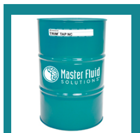
54-gallon drum SKU: TAPNC-54G UPC-12: 641238009399