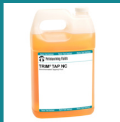
1-gallon jug SKU: TAPNC-1G UPC-12: 641238009337