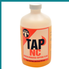
1-pint bottle SKU: TAPNC-1P UPC-12: 641238009429