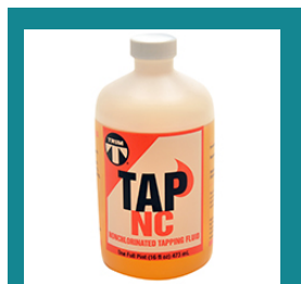
1-pint bottle SKU: TAPNC-1P UPC-12: 641238009429