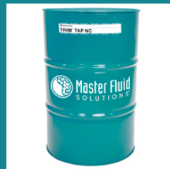
54-gallon drum SKU: TAPNC-54G UPC-12: 641238009399