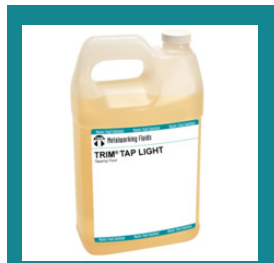
1-gallon jug SKU: TAPLT-1G UPC-12: 641238009139