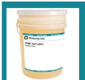
5-gallon pail SKU: TAPLT-5G UPC-12: 641238009184