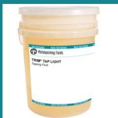
5-gallon pail SKU: TAPLT-5G UPC-12: 641238009184