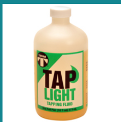
1-pint bottle SKU: TAPLT-1P UPC-12: 641238009221