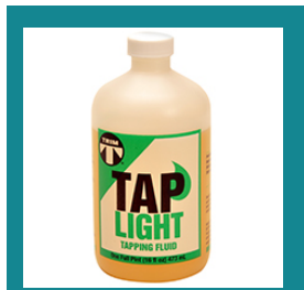
1-pint bottle SKU: TAPLT-1P UPC-12: 641238009221