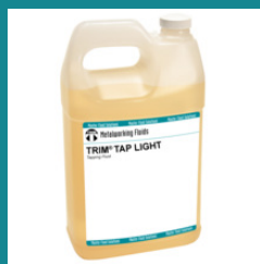
1-gallon jug SKU: TAPLT-1G UPC-12: 641238009139