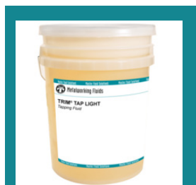
5-gallon pail SKU: TAPLT-5G UPC-12: 641238009184