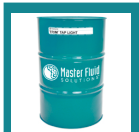
54-gallon drum SKU: TAPLT-54G UPC-12: 641238009191