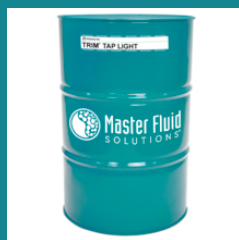
54-gallon drum SKU: TAPLT-54G UPC-12: 641238009191