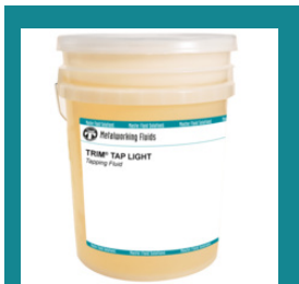
5-gallon pail SKU: TAPLT-5G UPC-12: 641238009184