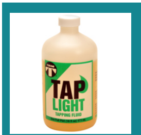
1-pint bottle SKU: TAPLT-1P UPC-12: 641238009221