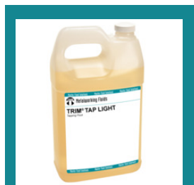
1-gallon jug SKU: TAPLT-1G UPC-12: 641238009139