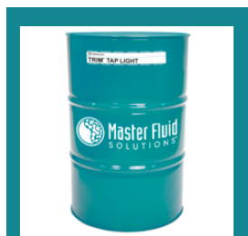
54-gallon drum SKU: TAPLT-54G UPC-12: 641238009191