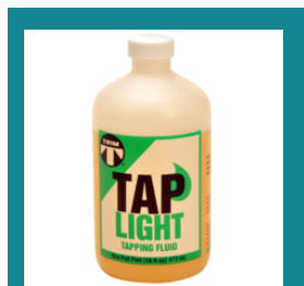
1-pint bottle SKU: TAPLT-1P UPC-12: 641238009221