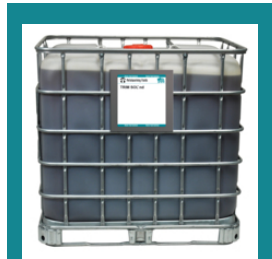
270-gallon tote SKU: SOLND-270G UPC-12: 641238034230