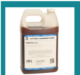
1-gallon jug SKU: SOLND-1G UPC-12: 641238008705