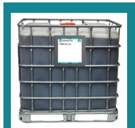
270-gallon tote SKU: SOLND-270G UPC-12: 641238034230