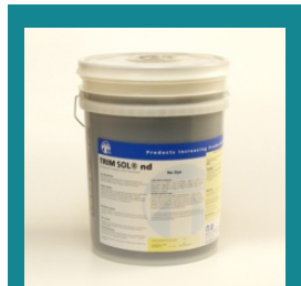
5-gallon pail SKU: SOLND-5G UPC-12: 641238008729