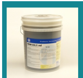
5-gallon pail SKU: SOLND-5G UPC-12: 641238008729