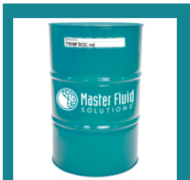
54-gallon drum SKU: SOLND-54G UPC-12: 641238008736