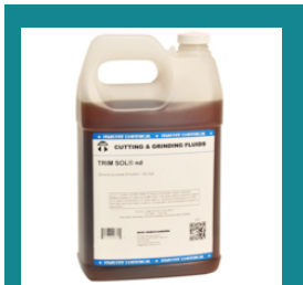
1-gallon jug SKU: SOLND-1G UPC-12: 641238008705