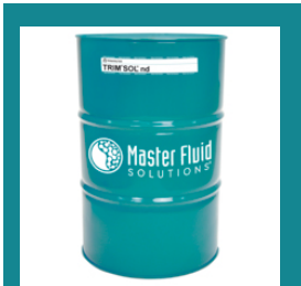
54-gallon drum SKU: SOLND-54G UPC-12: 641238008736