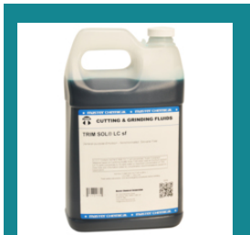
1-gallon jug SKU: SOLLCSF-1G UPC-12: 641238008651