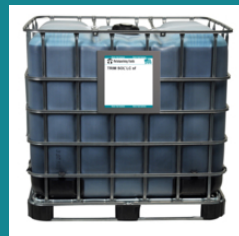
270-gallon tote SKU: SOLLCSF-270G UPC-12: 641238036234