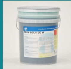
5-gallon pail SKU: SOLLCSF-5G UPC-12: 641238008668