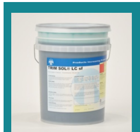
5-gallon pail SKU: SOLLCSF-5G UPC-12: 641238008668