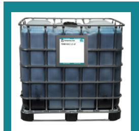
270-gallon tote SKU: SOLLCSF-270G UPC-12: 641238036234