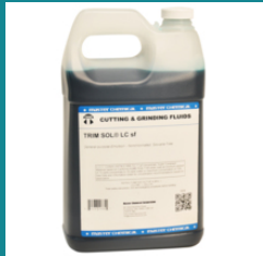
1-gallon jug SKU: SOLLCSF-1G UPC-12: 641238008651