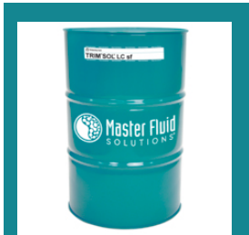
54-gallon drum SKU: SOLLCSF-54G UPC-12: 641238008675