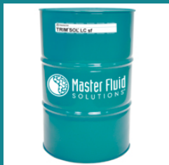
54-gallon drum SKU: SOLLCSF-54G UPC-12: 641238008675