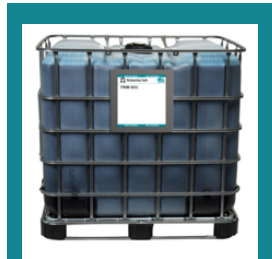
270-gallon tote SKU: SOL-270G UPC-12: 641238034216