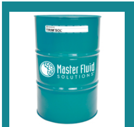
54-gallon drum SKU: SOL-54G UPC-12: 641238008408