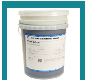
5-gallon pail SKU: SOL-5G UPC-12: 641238008392