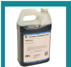
1-gallon jug SKU: SOL-1G UPC-12: 641238008361