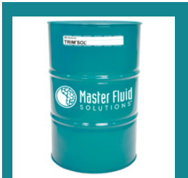
54-gallon drum SKU: SOL-54G UPC-12: 641238008408