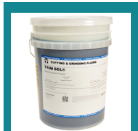
5-gallon pail SKU: SOL-5G UPC-12: 641238008392