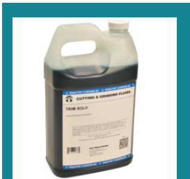
1-gallon jug SKU: SOL-1G UPC-12: 641238008361