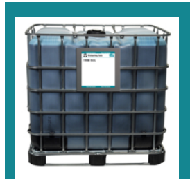
270-gallon tote SKU: SOL-270G UPC-12: 641238034216

TRIM SOL ® | ©1963-2026 Master Fluid Solutions ® | 2026-05-06