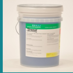
5-gallon pail SKU: SKRAMEX-5G UPC-12: 641238022947