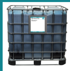
270-gallon tote SKU: SKRAMEX-270G UPC-12: 641238023012

Master STAGES™ Skramex™ | ©1998-2026 Master Fluid Solutions® | 2026-06-09