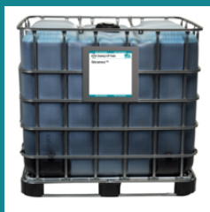
270-gallon tote SKU: SKRAMEX-270G UPC-12: 641238023012

Master STAGES™ Skramex™ | ©1998-2026 Master Fluid Solutions® | 2026-02-07