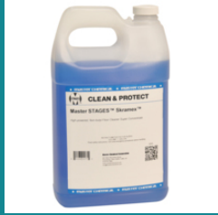
1-gallon jug SKU: SKRAMEX-1G UPC-12: 641238022923