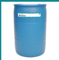
54-gallon drum SKU: SKRAMEX-54G UPC-12: 641238022954