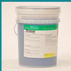
5-gallon pail SKU: SKRAMEX-5G UPC-12: 641238022947