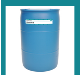
54-gallon drum SKU: SKIDRID-54G UPC-12: 641238036524