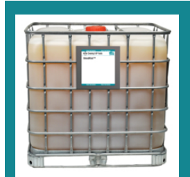
270-gallon tote SKU: SKIDRID-270G UPC-12: 641238036548