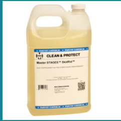
1-gallon jug SKU: SKIDRID-1G UPC-12: 641238036487