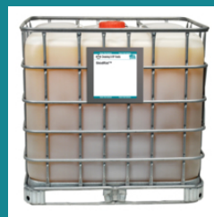
270-gallon tote SKU: SKIDRID-270G UPC-12: 641238036548

Master STAGES™ SkidRid™ | ©2002-2026 Master Fluid Solutions® | 2026-03-14