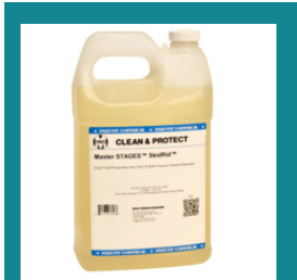
1-gallon jug SKU: SKIDRID-1G UPC-12: 641238036487