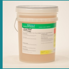
5-gallon pail SKU: SKIDRID-5G UPC-12: 641238036500