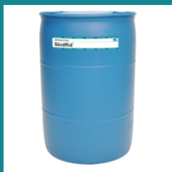
54-gallon drum SKU: SKIDRID-54G UPC-12: 641238036524