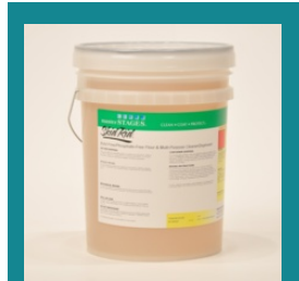
5-gallon pail SKU: SKIDRID-5G UPC-12: 641238036500