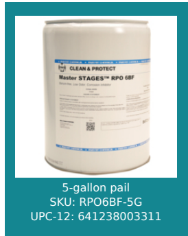
5-gallon pail SKU: RPO6BF-5G UPC-12: 641238003311