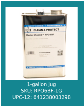
1-gallon jug SKU: RPO6BF-1G UPC-12: 641238003298