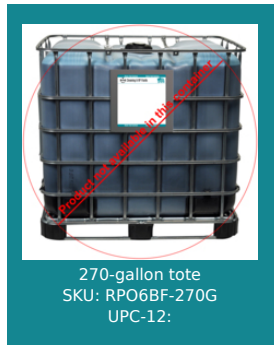
270-gallon tote SKU: RPO6BF-270G UPC-12: