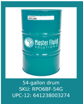
54-gallon drum SKU: RPO6BF-54G UPC-12: 641238003274