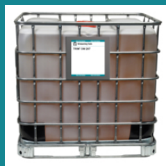
270-gallon tote SKU: OM287-270G UPC-12: 641238034131