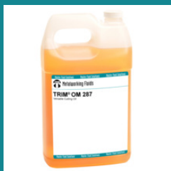
1-gallon jug SKU: OM287-1G UPC-12: 641238005667