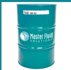
54-gallon drum SKU: OM287-54G UPC-12: 641238005698