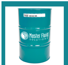
54-gallon drum SKU: OE322NS-54G UPC-12: 641238076643