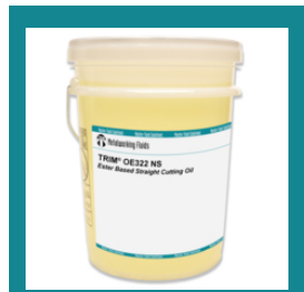
5-gallon pail SKU: OE322NS-5G UPC-12: 641238077572