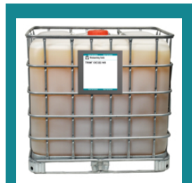
270-gallon tote SKU: OE322NS-270G UPC-12: 641238077619