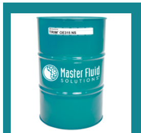
54-gallon drum SKU: OE315NS-54G UPC-12: 641238076667