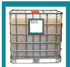
270-gallon tote SKU: OE315NS-270G UPC-12: 641238077565