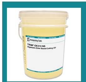
5-gallon pail SKU: OE315NS-5G UPC-12: 641238077527