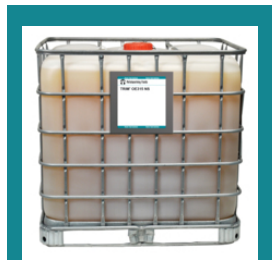
270-gallon tote SKU: OE315NS-270G UPC-12: 641238077565