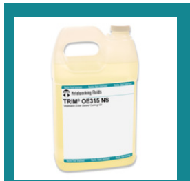
1-gallon jug SKU: OE315NS-1G UPC-12: 641238077541