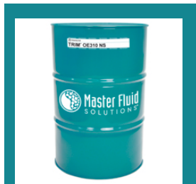
54-gallon drum SKU: OE310NS-54G UPC-12: 641238076728