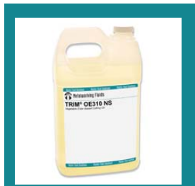
1-gallon jug SKU: OE310NS-1G UPC-12: 641238077497