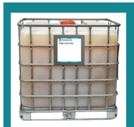
270-gallon tote SKU: OE310NS-270G UPC-12: 641238077510