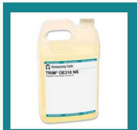
1-gallon jug SKU: OE310NS-1G UPC-12: 641238077497