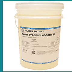
5-gallon pail SKU: NOCORS2-5G UPC-12: 641238042235