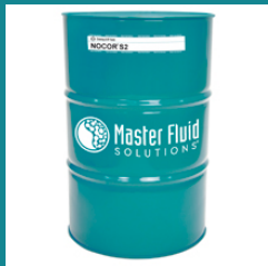
54-gallon drum SKU: NOCORS2-54G UPC-12: 641238042242