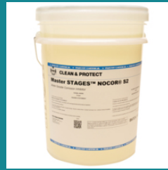
5-gallon pail SKU: NOCORS2-5G UPC-12: 641238042235