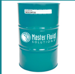
54-gallon drum SKU: NOCORS2-54G UPC-12: 641238042242