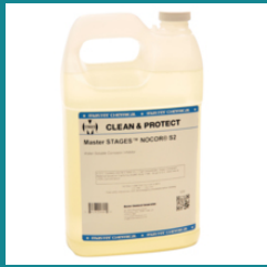
1-gallon jug SKU: NOCORS2-1G UPC-12: 641238043010