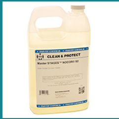
1-gallon jug SKU: NOCORS2-1G UPC-12: 641238043010