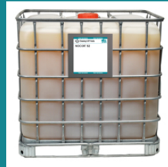
270-gallon tote SKU: NOCORS2-270G UPC-12: 641238042273

Master STAGES™ NOCOR® S2 | ©1998-2026 Master Fluid Solutions® | 2026-05-13