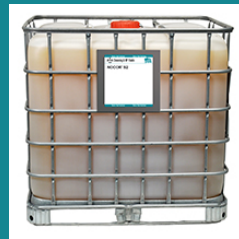
270-gallon tote SKU: NOCORS2-270G UPC-12: 641238042273