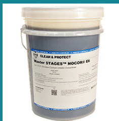
5-gallon pail SKU: NOCORE6-5G UPC-12: 641238042334