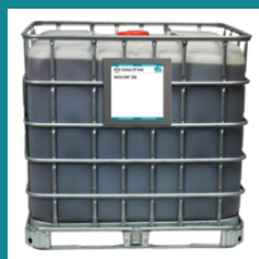
270-gallon tote SKU: NOCORE6-270G UPC-12: 641238042389