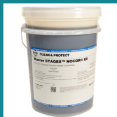
5-gallon pail SKU: NOCORE6-5G UPC-12: 641238042334