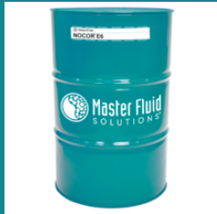
54-gallon drum SKU: NOCORE6-54G UPC-12: 641238042358