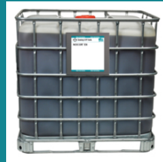
270-gallon tote SKU: NOCORE6-270G UPC-12: 641238042389