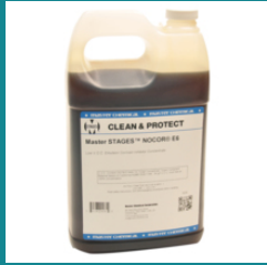
1-gallon jug SKU: NOCORE6-1G UPC-12: 641238042310