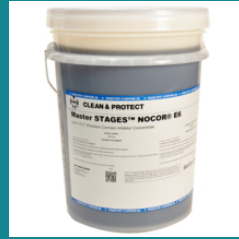
5-gallon pail SKU: NOCORE6-5G UPC-12: 641238042334