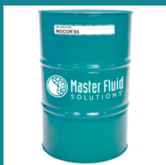
54-gallon drum SKU: NOCORE6-54G UPC-12: 641238042358