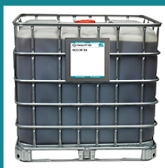
270-gallon tote SKU: NOCORE6-270G UPC-12: 641238042389