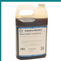
1-gallon jug SKU: NOCORE6-1G UPC-12: 641238042310