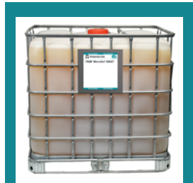
270-gallon tote SKU: MS690XT-270G UPC-12: 641238073017