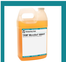
1-gallon jug SKU: MS690XT-1G UPC-12: 641238072973