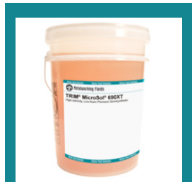
5-gallon pail SKU: MS690XT-5G UPC-12: 641238072997