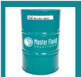
54-gallon drum SKU: MS690XT-54G UPC-12: 641238073000