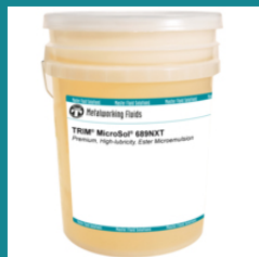
5-gallon pail SKU: MS689NXT-5G UPC-12: 641238083238