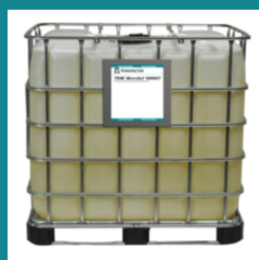
270-gallon tote SKU: MS689NXT-270G UPC-12: 641238083252