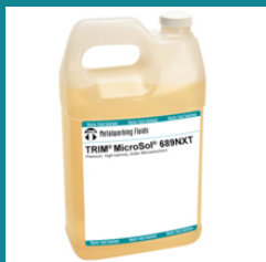
1-gallon jug SKU: MS689NXT-1G UPC-12: 641238083214