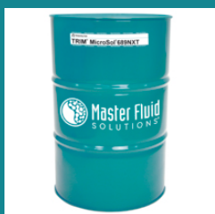
54-gallon drum SKU: MS689NXT-54G UPC-12: 641238083245