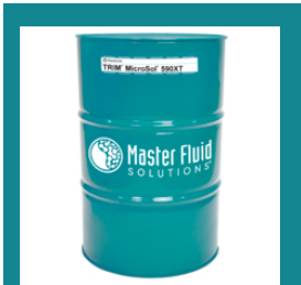
54-gallon drum SKU: MS590XT-54G UPC-12: 641238074434