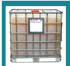
270-gallon tote SKU: MS590XT-270G UPC-12: 641238074472