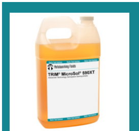
1-gallon jug SKU: MS590XT-1G UPC-12: 641238074458