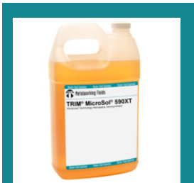
1-gallon jug SKU: MS590XT-1G UPC-12: 641238074458