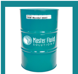
54-gallon drum SKU: MS590XT-54G UPC-12: 641238074434