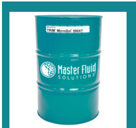
54-gallon drum SKU: MS590XT-54G UPC-12: 641238074434