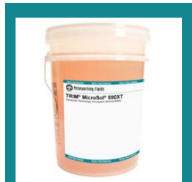
5-gallon pail SKU: MS590XT-5G UPC-12: 641238074441