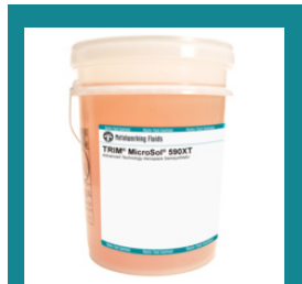
5-gallon pail SKU: MS590XT-5G UPC-12: 641238074441