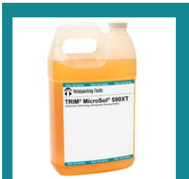
1-gallon jug SKU: MS590XT-1G UPC-12: 641238074458