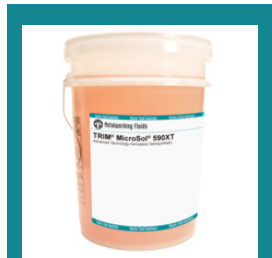
5-gallon pail SKU: MS590XT-5G UPC-12: 641238074441