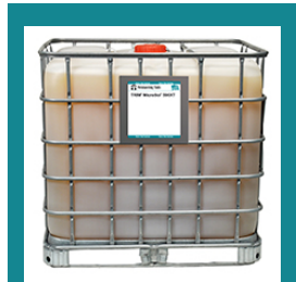
270-gallon tote SKU: MS590XT-270G UPC-12: 641238074472