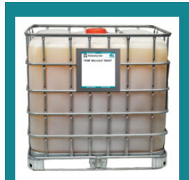
270-gallon tote SKU: MS590XT-270G UPC-12: 641238074472