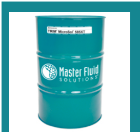
54-gallon drum SKU: MS585XT-54G UPC-12: 641238065814