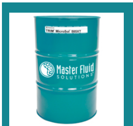
54-gallon drum SKU: MS585XT-54G UPC-12: 641238065814