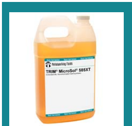
1-gallon jug SKU: MS585XT-1G UPC-12: 641238065838