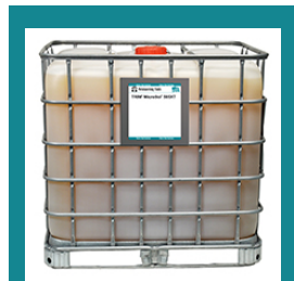
270-gallon tote SKU: MS585XT-270G UPC-12: 641238065852