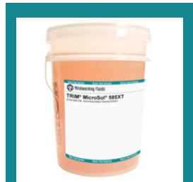
5-gallon pail SKU: MS585XT-5G UPC-12: 641238065821