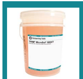
5-gallon pail SKU: MS585XT-5G UPC-12: 641238065821