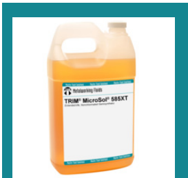
1-gallon jug SKU: MS585XT-1G UPC-12: 641238065838