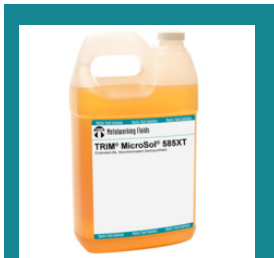
1-gallon jug SKU: MS585XT-1G UPC-12: 641238065838