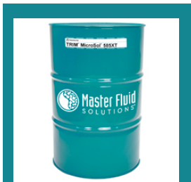
54-gallon drum SKU: MS585XT-54G UPC-12: 641238065814