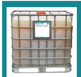
270-gallon tote SKU: MS585XT-270G UPC-12: 641238065852