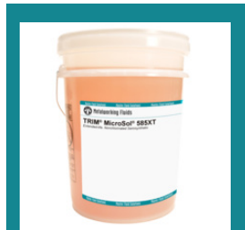
5-gallon pail SKU: MS585XT-5G UPC-12: 641238065821