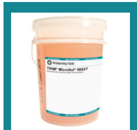
5-gallon pail SKU: MS585XT-5G UPC-12: 641238065821