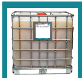
270-gallon tote SKU: MS585XT-270G UPC-12: 641238065852