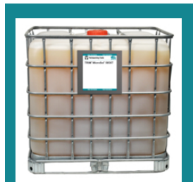
270-gallon tote SKU: MS585XT-270G UPC-12: 641238065852