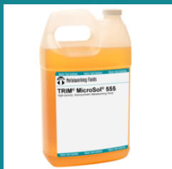
1-gallon jug SKU: MS555-1G UPC-12: 641238004257