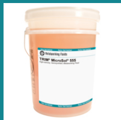
5-gallon pail SKU: MS555-5G UPC-12: 641238004240