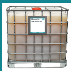
270-gallon tote SKU: MS555-270G UPC-12: 641238004295