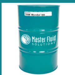
54-gallon drum SKU: MS555-54G UPC-12: 641238004233