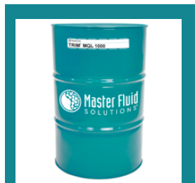
54-gallon drum SKU: MQL1000-54G UPC-12: 641238038597