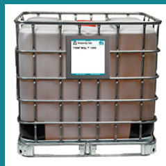
270-gallon tote SKU: MQL1000-270G UPC-12: 641238074779