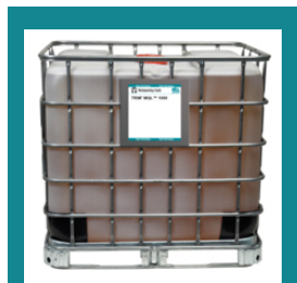
270-gallon tote SKU: MQL1000-270G UPC-12: 641238074779