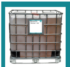
270-gallon tote SKU: MQL1000-270G UPC-12: 641238074779