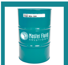
54-gallon drum SKU: MQL1000-54G UPC-12: 641238038597