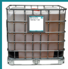
270-gallon tote SKU: MQL1000-270G UPC-12: 641238074779