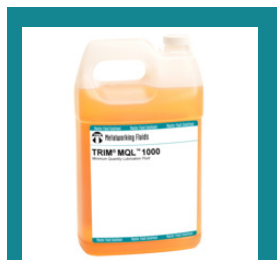
1-gallon jug SKU: MQL1000-1G UPC-12: 641238038559