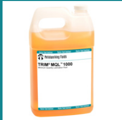
1-gallon jug SKU: MQL1000-1G UPC-12: 641238038559