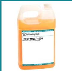
1-gallon jug SKU: MQL1000-1G UPC-12: 641238038559