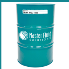
54-gallon drum SKU: MQL1000-54G UPC-12: 641238038597