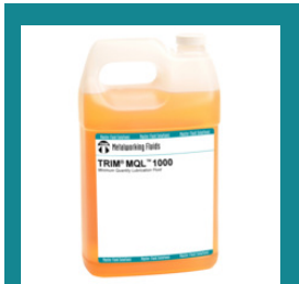
1-gallon jug SKU: MQL1000-1G UPC-12: 641238038559