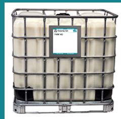
270-gallon tote SKU: HD-270G UPC-12: 641238046875