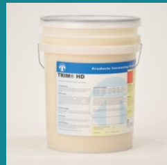
5-gallon pail SKU: HD-5G UPC-12: 641238003670