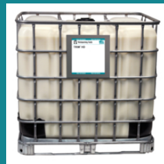
270-gallon tote SKU: HD-270G UPC-12: 641238046875