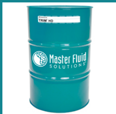
54-gallon drum SKU: HD-54G UPC-12: 641238003687