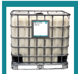
270-gallon tote SKU: HD-270G UPC-12: 641238046875