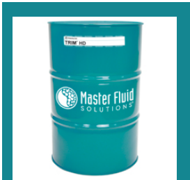
54-gallon drum SKU: HD-54G UPC-12: 641238003687