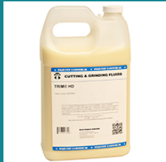
1-gallon jug SKU: HD-1G UPC-12: 641238003656