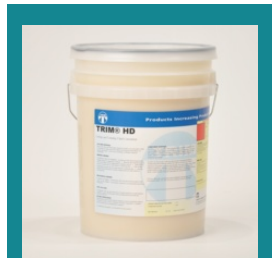
5-gallon pail SKU: HD-5G UPC-12: 641238003670