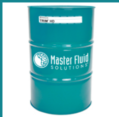
54-gallon drum SKU: HD-54G UPC-12: 641238003687