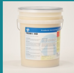
5-gallon pail SKU: HD-5G UPC-12: 641238003670