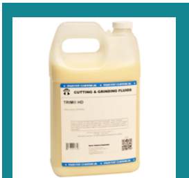
1-gallon jug SKU: HD-1G UPC-12: 641238003656