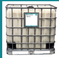
270-gallon tote SKU: HD-270G UPC-12: 641238046875