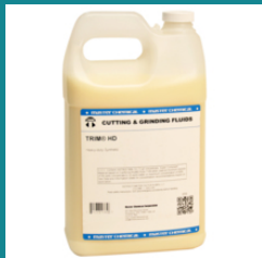
1-gallon jug SKU: HD-1G UPC-12: 641238003656