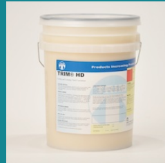
5-gallon pail SKU: HD-5G UPC-12: 641238003670