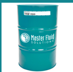
54-gallon drum SKU: E925-54G UPC-12: 641238073680