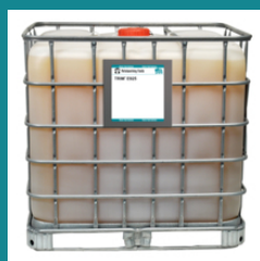
270-gallon tote SKU: E925-270G UPC-12: 641238073741