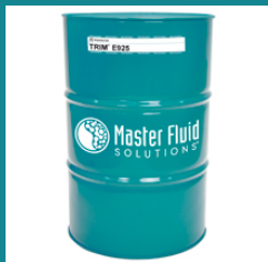
54-gallon drum SKU: E925-54G UPC-12: 641238073680