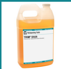
1-gallon jug SKU: E925-1G UPC-12: 641238073703