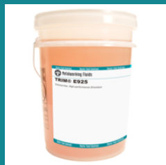
5-gallon pail SKU: E925-5G UPC-12: 641238073697