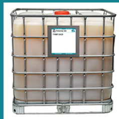
270-gallon tote SKU: E925-270G UPC-12: 641238073741