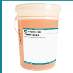
5-gallon pail SKU: E925-5G UPC-12: 641238073697