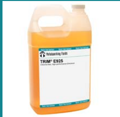
1-gallon jug SKU: E925-1G UPC-12: 641238073703