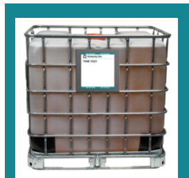
270-gallon tote SKU: E923-270G UPC-12: 641238079910