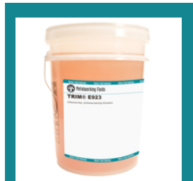
5-gallon pail SKU: E923-5G UPC-12: 641238074588