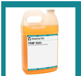
1-gallon jug SKU: E923-1G UPC-12: 641238074595