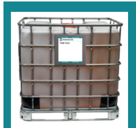
270-gallon tote SKU: E923-270G UPC-12: 641238079910