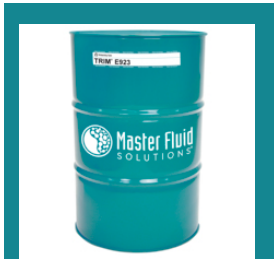
54-gallon drum SKU: E923-54G UPC-12: 641238074571