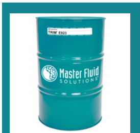
54-gallon drum SKU: E923-54G UPC-12: 641238074571