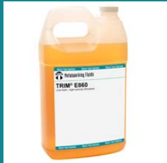
1-gallon jug SKU: E860-1G UPC-12: 641238081845