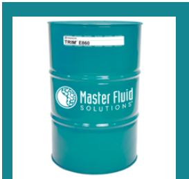
54-gallon drum SKU: E860-54G UPC-12: 641238081876