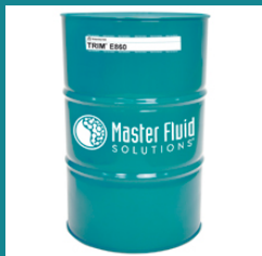
54-gallon drum SKU: E860-54G UPC-12: 641238081876