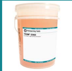
5-gallon pail SKU: E860-5G UPC-12: 641238081869