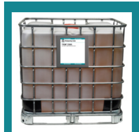
270-gallon tote SKU: E860-270G UPC-12: 641238081883