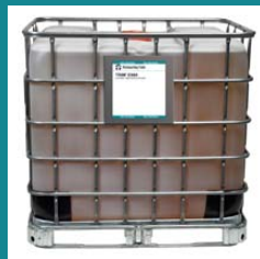
270-gallon tote SKU: E860-270G UPC-12: 641238081883