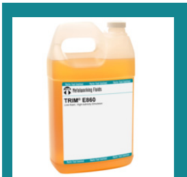
1-gallon jug SKU: E860-1G UPC-12: 641238081845