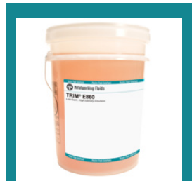
5-gallon pail SKU: E860-5G UPC-12: 641238081869