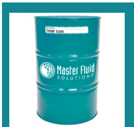
54-gallon drum SKU: E206-54G UPC-12: 641238003090