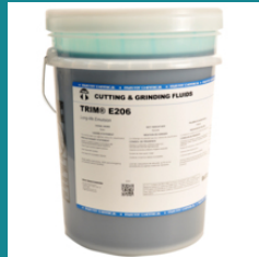
5-gallon pail SKU: E206-5G UPC-12: 641238003083