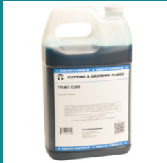
1-gallon jug SKU: E206-1G UPC-12: 641238003052