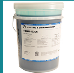
5-gallon pail SKU: E206-5G UPC-12: 641238003083