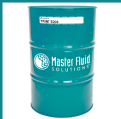
54-gallon drum SKU: E206-54G UPC-12: 641238003090