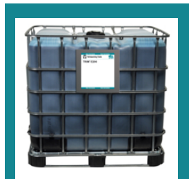
270-gallon tote SKU: E206-270G UPC-12: 641238033882