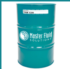
54-gallon drum SKU: E206-54G UPC-12: 641238003090