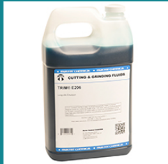
1-gallon jug SKU: E206-1G UPC-12: 641238003052