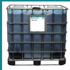
270-gallon tote SKU: E206-270G UPC-12: 641238033882