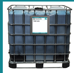
270-gallon tote SKU: E206-270G UPC-12: 641238033882