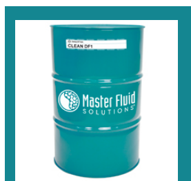
54-gallon drum SKU: CLDF1-54G UPC-12: 641238002710