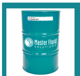
54-gallon drum SKU: CLDF1-54G UPC-12: 641238002710