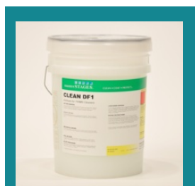
5-gallon pail SKU: CLDF1-5G UPC-12: 641238002703