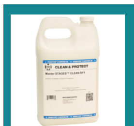
1-gallon jug SKU: CLDF1-1G UPC-12: 641238002680