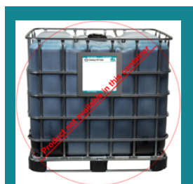
270-gallon tote SKU: CLDF1-270G UPC-12: