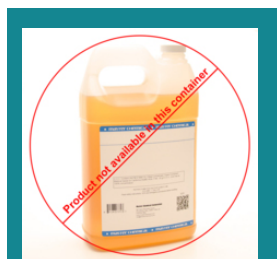
1-gallon jug SKU: CLEANAMO-1G UPC-12: 641238070764