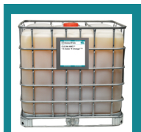
270-gallon tote SKU: CLAMO-270G UPC-12: 641238069195

Master STAGES™ CLEAN AMO™ | ©2004-2026 Master Fluid Solutions® | 2026-05-13