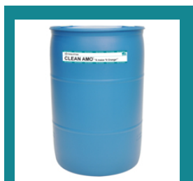
54-gallon drum SKU: CLAMO-54G UPC-12: 641238039310