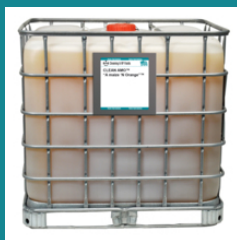
270-gallon tote SKU: CLAMO-270G UPC-12: 641238069195

Master STAGES™ CLEAN AMO™ | ©2004-2026 Master Fluid Solutions® | 2026-02-06