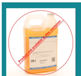
1-gallon jug SKU: CLEANAMO-1G UPC-12: 641238070764