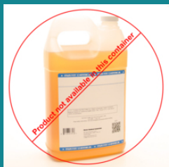
1-gallon jug SKU: CLEANAMO-1G UPC-12: 641238070764