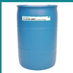
54-gallon drum SKU: CLAMO-54G UPC-12: 641238039310