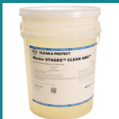
5-gallon pail SKU: CLAMO-5G UPC-12: 641238039280