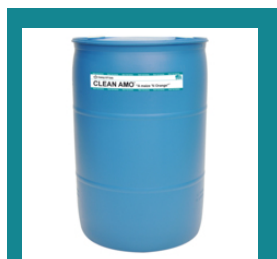
54-gallon drum SKU: CLAMO-54G UPC-12: 641238039310