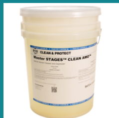
5-gallon pail SKU: CLAMO-5G UPC-12: 641238039280