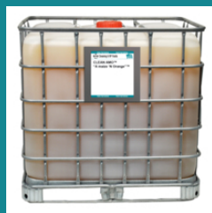
270-gallon tote SKU: CLAMO-270G UPC-12: 641238069195

Master STAGES™ CLEAN AMO™ | ©2004-2025 Master Fluid Solutions® | 2025-12-14