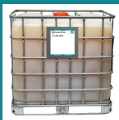
270-gallon tote SKU: CL2430-270G UPC-12: 641238041849

Master STAGES™ CLEAN 2430 | ©2005-2025 Master Fluid Solutions® | 2025-12-17