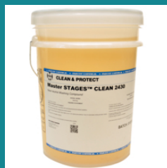
5-gallon pail SKU: CL2430-5G UPC-12: 641238041801