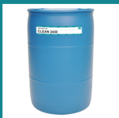
54-gallon drum SKU: CL2430-54G UPC-12: 641238041818