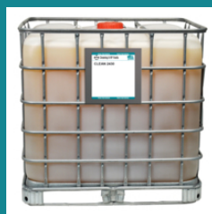
270-gallon tote SKU: CL2430-270G UPC-12: 641238041849

Master STAGES™ CLEAN 2430 | ©2005-2026 Master Fluid Solutions® | 2026-02-03