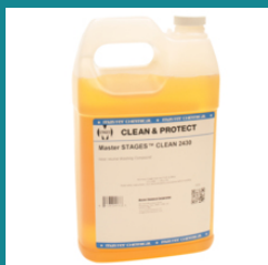
1-gallon jug SKU: CL2430-1G UPC-12: 641238041788