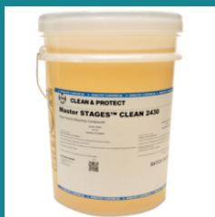
5-gallon pail SKU: CL2430-5G UPC-12: 641238041801