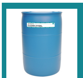
54-gallon drum SKU: CL2115AL-54G UPC-12: 641238040569