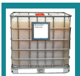
270-gallon tote SKU: CL2115AL-270G UPC-12: 641238040583

Master STAGES™ CLEAN 2115AL | ©2005-2026 Master Fluid Solutions® | 2026-05-13