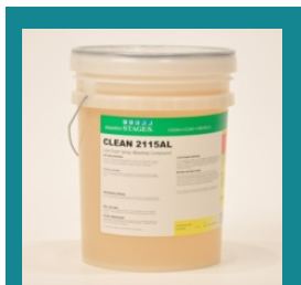
5-gallon pail SKU: CL2115AL-5G UPC-12: 641238040545