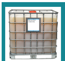
270-gallon tote SKU: CL2115AL-270G UPC-12: 641238040583