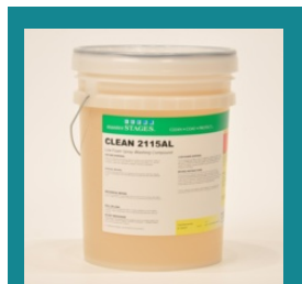
5-gallon pail SKU: CL2115AL-5G UPC-12: 641238040545