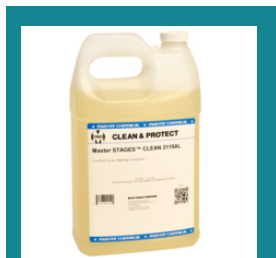
1-gallon jug SKU: CL2115AL-1G UPC-12: 641238040521