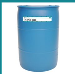
54-gallon drum SKU: CL2030-54G UPC-12: 641238042556