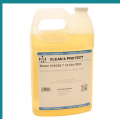
1-gallon jug SKU: CL2030-1G UPC-12: 641238042518