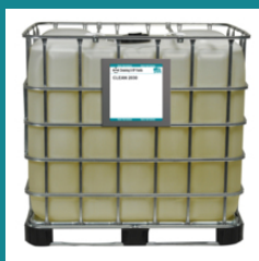
270-gallon tote SKU: CL2030-270G UPC-12: 641238042570

Master STAGES™ CLEAN 2030 | ©2005-2026 Master Fluid Solutions® | 2026-02-06