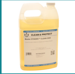
1-gallon jug SKU: CL2030-1G UPC-12: 641238042518