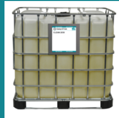
270-gallon tote SKU: CL2030-270G UPC-12: 641238042570

Master STAGES™ CLEAN 2030 | ©2005-2026 Master Fluid Solutions® | 2026-05-10