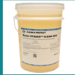
5-gallon pail SKU: CL2030-5G UPC-12: 641238042532