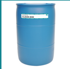
54-gallon drum SKU: CL2030-54G UPC-12: 641238042556