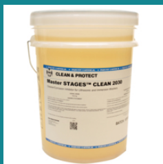
5-gallon pail SKU: CL2030-5G UPC-12: 641238042532