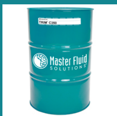
54-gallon drum SKU: C350-54G UPC-12: 641238047131