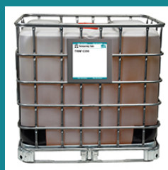
270-gallon tote SKU: C350-270G UPC-12: 641238047162