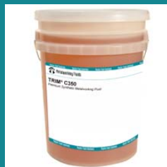
5-gallon pail SKU: C350-5G UPC-12: 641238047155