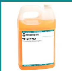
1-gallon jug SKU: C350-1G UPC-12: 641238047179