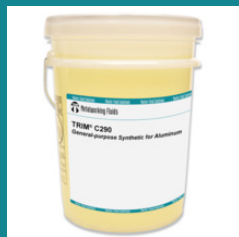
5-gallon pail SKU: C290-5G UPC-12: 641238082378