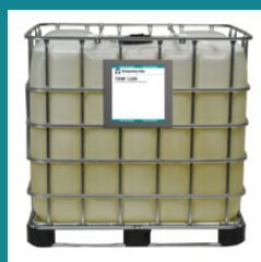
270-gallon tote SKU: C290-270G UPC-12: 641238082392