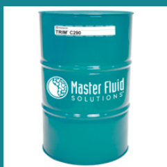
54-gallon drum SKU: C290-54G UPC-12: 641238082385