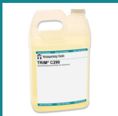
1-gallon jug SKU: C290-1G UPC-12: 641238082354