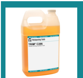
1-gallon jug SKU: C286-1G UPC-12: 641238082996