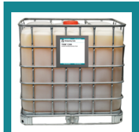
270-gallon tote SKU: C286-270G UPC-12: 641238083016