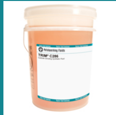
5-gallon pail SKU: C286-5G UPC-12: 641238082989