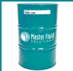
54-gallon drum SKU: C286-54G UPC-12: 641238082972