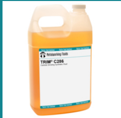
1-gallon jug SKU: C286-1G UPC-12: 641238082996