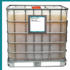
270-gallon tote SKU: C286-270G UPC-12: 641238083016