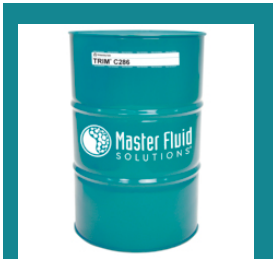
54-gallon drum SKU: C286-54G UPC-12: 641238082972