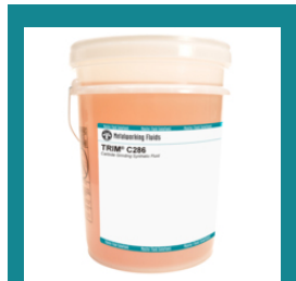
5-gallon pail SKU: C286-5G UPC-12: 641238082989