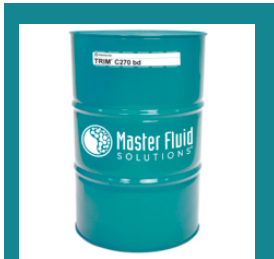
54-gallon drum SKU: C270BD-54G UPC-12: 641238001317