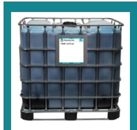
270-gallon tote SKU: C270BD-270G UPC-12: 641238034018