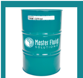
54-gallon drum SKU: C270BD-54G UPC-12: 641238001317