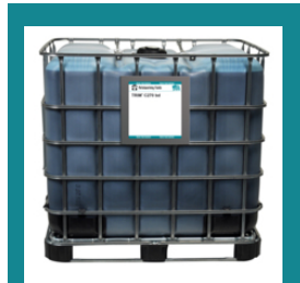
270-gallon tote SKU: C270BD-270G UPC-12: 641238034018