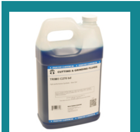
1-gallon jug SKU: C270BD-1G UPC-12: 641238066743