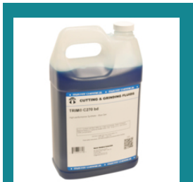
1-gallon jug SKU: C270BD-1G UPC-12: 641238066743