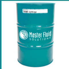
54-gallon drum SKU: C270BD-54G UPC-12: 641238001317