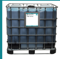
270-gallon tote SKU: C270BD-270G UPC-12: 641238034018