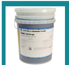
5-gallon pail SKU: C270BD-5G UPC-12: 641238001300