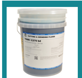
5-gallon pail SKU: C270BD-5G UPC-12: 641238001300