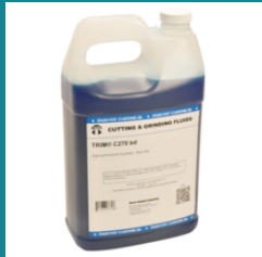
1-gallon jug SKU: C270BD-1G UPC-12: 641238066743