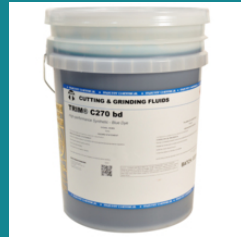
5-gallon pail SKU: C270BD-5G UPC-12: 641238001300