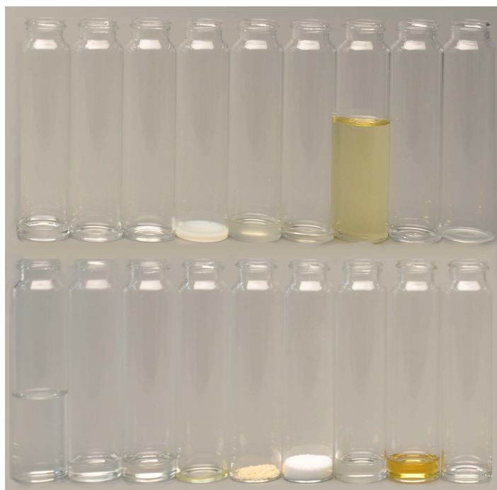
A typical Master Fluid Solutions microemulsion concentrate is comprised of 18 ingredients and though it is clearly a very complex formula, it does not contain any unnecessary ingredients.

may be appropriate; if more lubricity is needed, a higher concentration may be required. Once a target working solution is determined, it is important to monitor its fluid concentration level and make adjustments to keep it as close to target as possible. In order to check the concentration of your working solution after the initial sump fill, you use Brix factors and your refractometer reading.